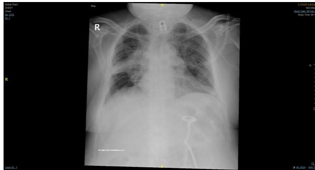
Figure 1: Chest x ray of the patient

Cardiac magnetic resonance (CMR) study was done, and it confirmed the presence of a single mass attached to the anterolateral wall of the left ventricle typical for metastases (Fig. 1-3).