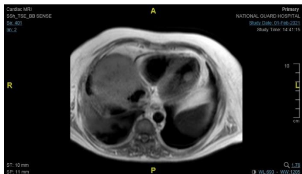
Figure 3: Cardiac MRI show the mass in the left ventricle same as in echo