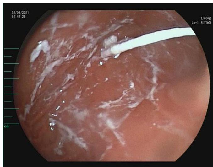
Figure 1: Swab found in the stomach. The picture was taken during esophagogastroduodenoscopy.

As the swab was neither detected in the upper nor the lower airways, an esophagogastroduodenoscopy was performed next. The approximately 10 cm long foreign body could be recovered as a whole without further complications from the stomach.